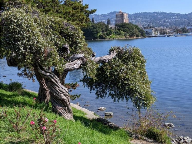
March 9 – Lake Merritt walk before Annual Meeting