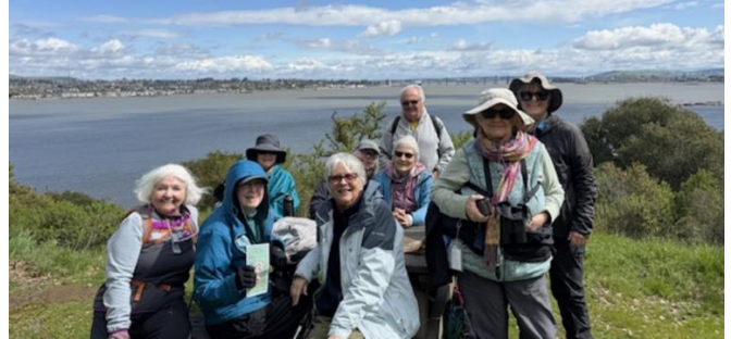
March 13 – Carquinez Scenic Drive