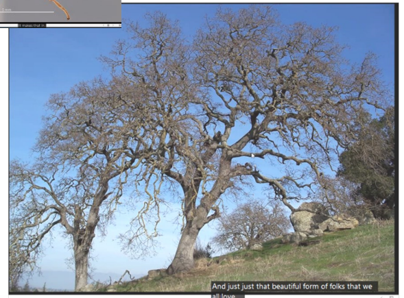
Part of Kevin's slide presentation: A beautiful oak tree and an oak gall wasp.

A huge Thank You for all your contributions last year!