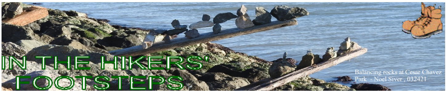
Balancing rocks at Cesar Chavez Park - Noel Siver, 032421