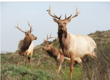
Tule elk at Tomales Point, Marin County, Feb 12