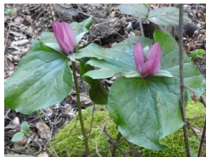
Pink and white Giant Trillium at Tilden Park, Mar 12 ; Burgundy Giant Trillium at Joaquin Miller Park, Mar 19