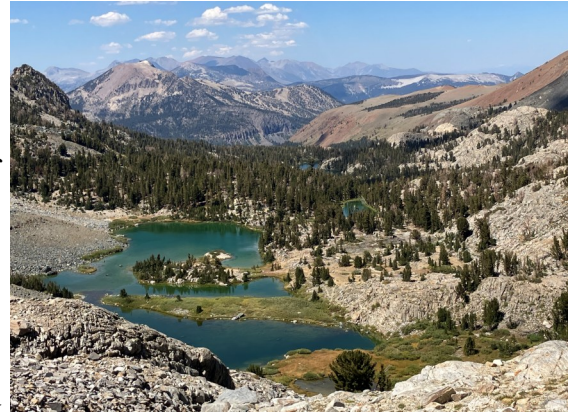
View from the Duck Lake Pass