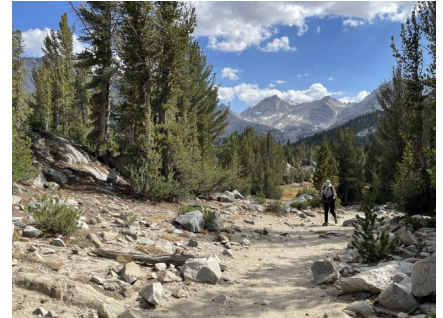
Surrounded by Spectacular Mountains