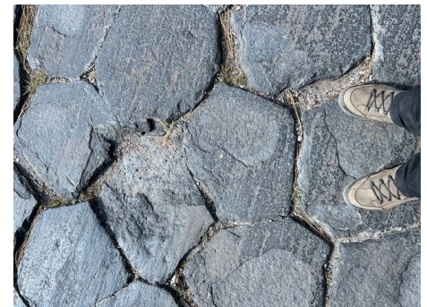
Devils Postpile—bird's eyeview

photos, we hiked 1.5 miles to Rainbow Falls, the highest waterfall on the middle fork of the San Joaquin River. This powerful waterfall, named for the rainbows that appear in its mist, plunges 101 feet. According to the interpretative panel at the viewpoint, this waterfall continues to move upstream due to undercutting. Currently, it's about 500 feet from its original location.