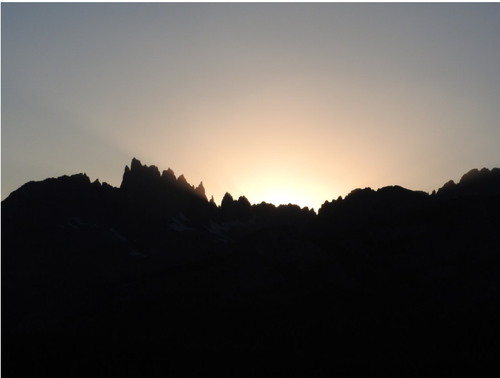
View of Mammoth Mountains at Sunset

members continued to Box Lake, then along the Long Lake meadow. It was along a southern bank of scree that some of us were thrilled to witness a pika scamper for about 2 seconds before it disappeared. The final ascent led to Gem Lakes, our turn around point at 11,000 feet. The lunch stop here afforded a bit of time to appreciate patches of snow on the granite walls surrounding the lake and some hikers soaked their feet in the icy water. The group unanimously agreed to hike to an additional lake named Chickenfoot before we returned