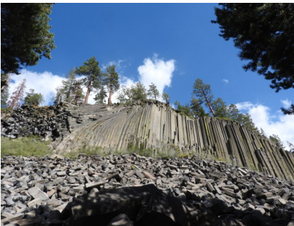
Devils Postpile—viewed from the base