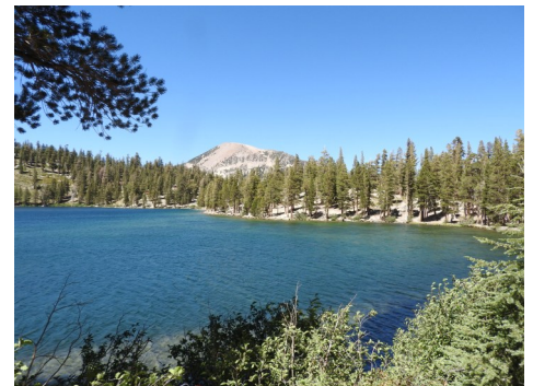
One of the Many Alpine Lakes