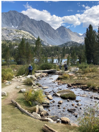
One of Many Babbling Brooks

Eight 'Easy hikers' set off at 9 a.m. to explore the #1 rated hike in Mono County. It lived up to its name! The start of the trail bordered Rock Creek at 9300' elevation. The first part of the trail is known as Mosquito Flat but no mosquitos in sight fortunately. We next used Little Lakes Trail which ascended another 500' as we passed four beautiful lakes – Mack Lake, Marsh Lake, Heart Lake, and Box Lake. To that point we had hiked 1.95 miles. We turned back and revisited Heart Lake for lunch. The lakes and surrounding vegetation were gorgeous under clear blue skies. We saw lupine and yarrow among another few wildflowers. We returned at 1:30 p.m.