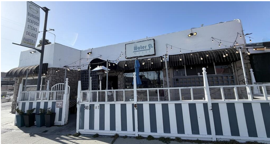
Water Street Grill 503 Water Street Santa Cruz, CA 95060