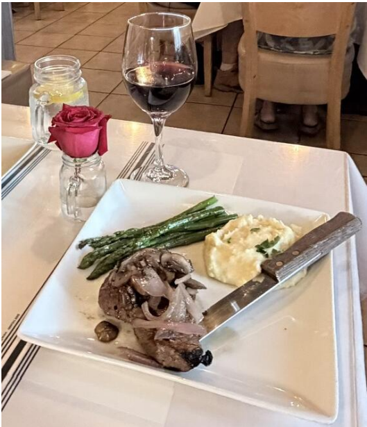
Seasoned sirloin steak