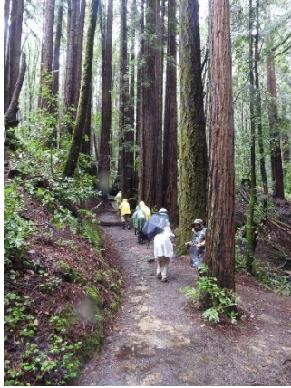
Heading up the trail

With hopes of spring showers abating, 14 hikers headed to Henry Cowell Redwoods State Park under rainy skies. We hiked a loop along the San Lorenzo River Trail from the Visitors Center to the Observation Deck Overlook, approximately six miles with very steep steps.