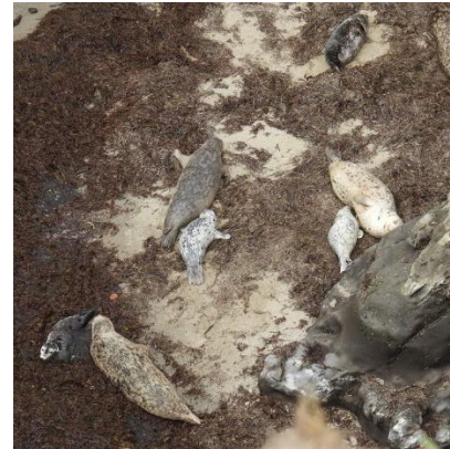
Harbor seal mothers and their pups

A huge flight of pelicans flew overhead this sunny day. Brandt's cormorants were perched on the small rocky islands. Pigeon guillemots were paired up on the rocks. Mike Branning spotted a juvenile gray whale carcass on the beach below being devoured by the gulls. The most amazing thing was watching the harbor seals swim and nurse their young ones. We felt very fortunate to see this.