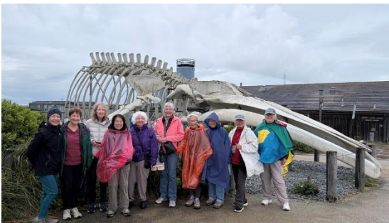
Seymour Marine Discovery Center