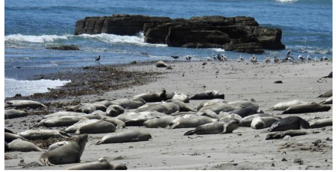
Weaned elephant seals on the beach at South Point

Next, we moved on to Bight Beach where we saw more weaners, including a pair of juvenile males who were play fighting. At Bight Beach we also saw arroyo willows with bright red galls on their leaves. From Steve Chun we learned that these galls are caused by an insect called the willow apple gall sawfly that lays its eggs on the leaves. Their larvae hatch and feed inside the galls. The galls are green when unoccupied and bright red when they contain a larva.